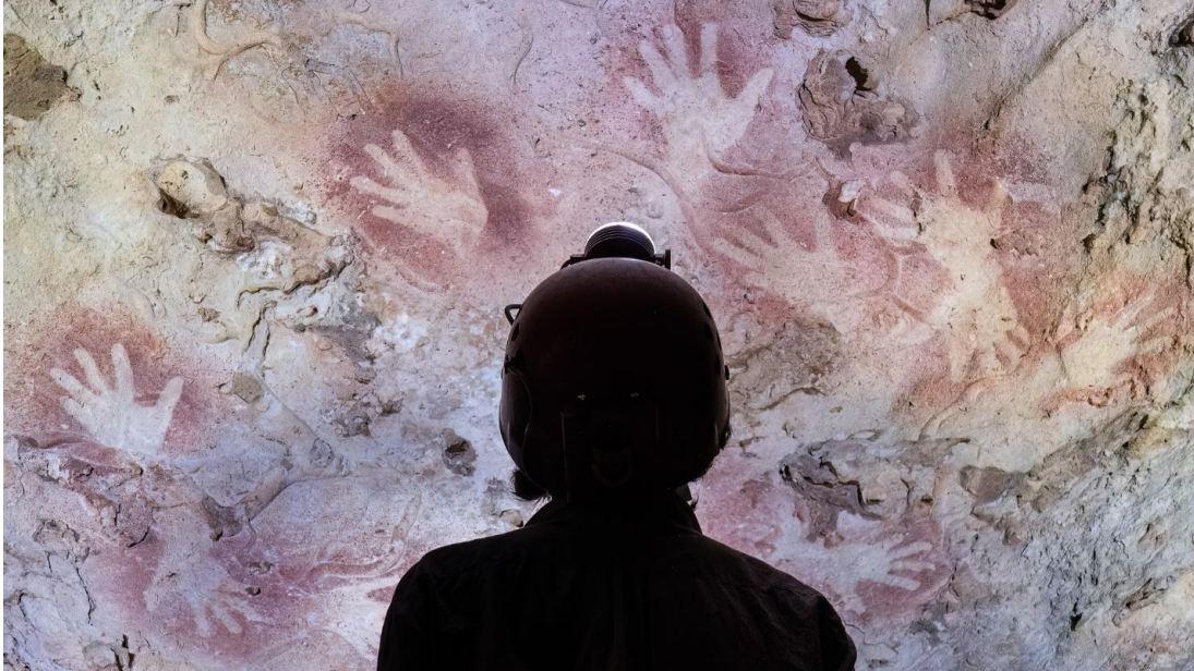
File Name: Nullarbor-7.

The Nullarbor is a living cultural landscape of priceless importance. Mirning People are the Traditional Custodians of the Nullarbor limestone Country.