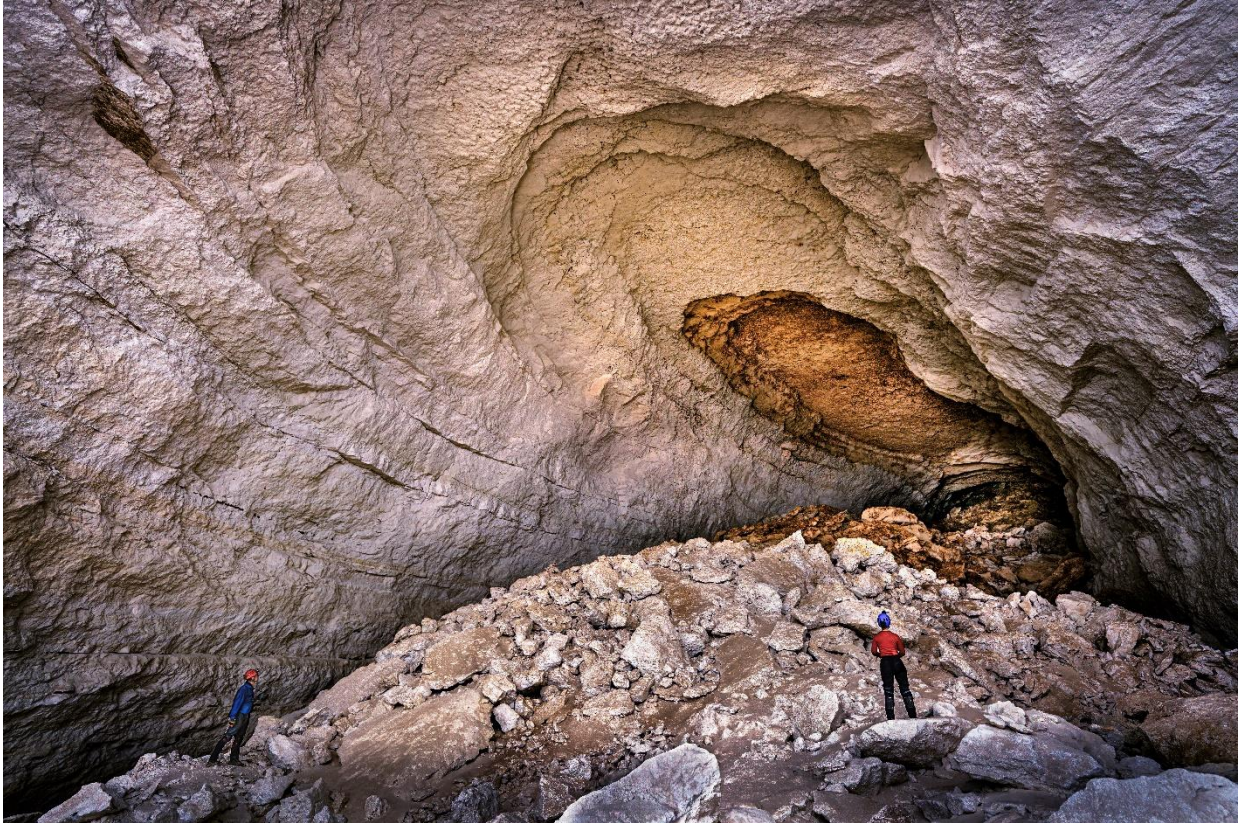
File Name: Nullarbor-11.

This spectacular cave of exceptional natural heritage significance lies only a few kilometres away from the proposed colossal hydrogen / ammonia production plant and storage facility.