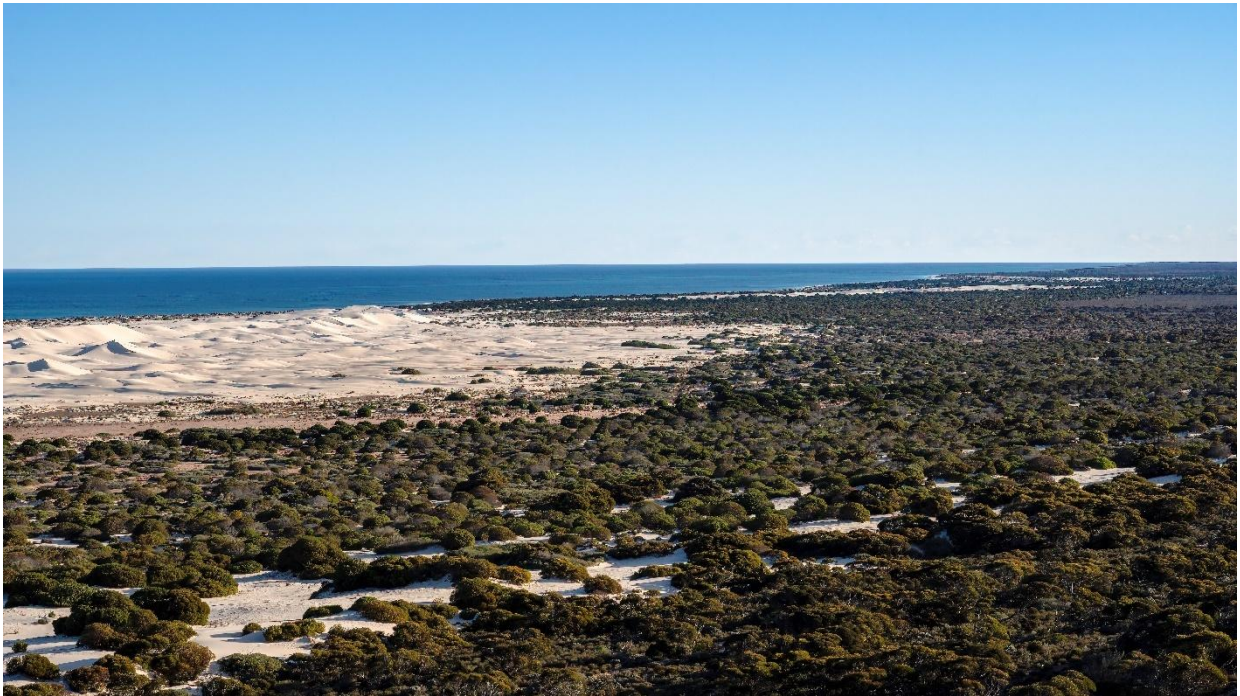
File Name: Nullarbor-9.

This wild spectacular and unspoiled view of the Yinyila sand dunes and the Southern Ocean from Eucla is well-known to travellers and tourists driving across the Nullarbor Plain. Yinyila is also a place of great cultural significance to the Yerkala Mirning People. If the proposed hydrogen hub is allowed to go ahead this unspoiled vista will be forever marred by a large desalination plant and shipping port ~ 20 km west of this popular lookout, where hydrogen / ammonia will be piped to large tanker ships for export to Korea.