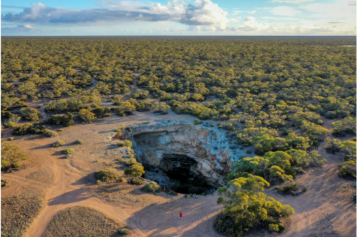
File Name: Nullarbor-10.

This gaping cave entrance ~ 60m across at its widest point leads into an enormous tunnel which slopes downwards to meet the aquifer ~ 90m below the surface, and from there the tunnel continues completely submerged, the realm of cave divers and rare microbial life forms.