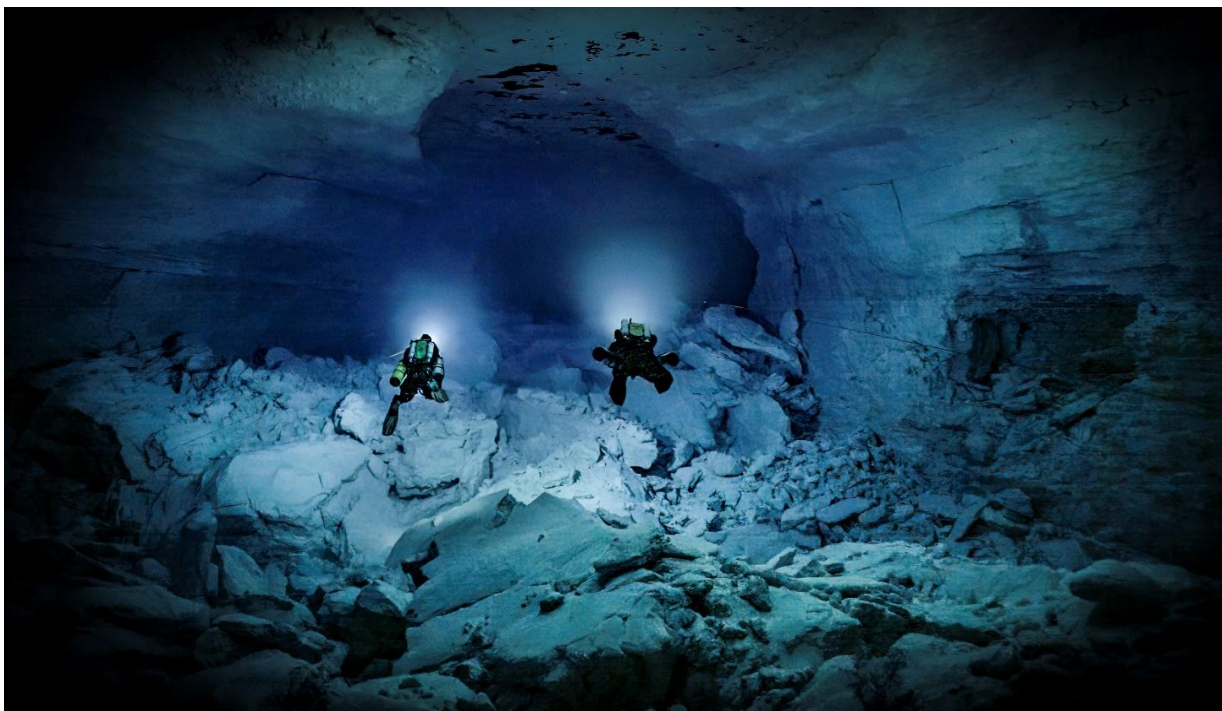
File Name: Nullarbor-4.

For more than 50 years cave divers have been exploring and mapping the stunningly beautiful and internationally famous underwater caves of the Nullarbor. This world-class cave lies only a few kilometres away from the proposed colossal hydrogen / ammonia production plant and storage facility.