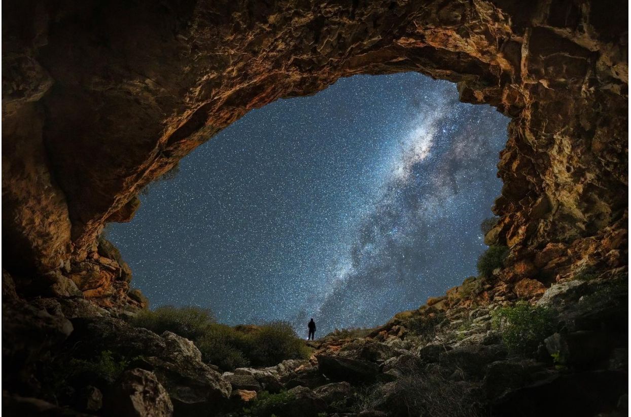
File Name: Nullarbor-12.

There is more to the Nullarbor (Latin: meaning “no trees”) than meets the eye. Beneath the surface lies an incredible hidden world of caves, of staggering beauty and scientific value.