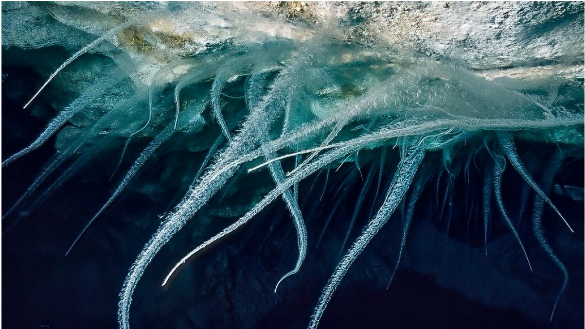
File Name: Nullarbor-5.

The cave lakes and underwater tunnels on the Nullarbor support rare and unique extremophile organisms known as microbial mantles, a highly unusual and specialized community of primitive bacteria and archaea of great scientific interest. Similar types of organisms are found in volcanic hot springs and deep ocean vents; however, the Nullarbor community represents a distinctive microbial ecosystem. These soft gelatinous tentacles, which can grow up to 50 cm in length, are extremely fragile and vulnerable to any kind of disturbance or groundwater contamination. This community lies only a few kilometres away from the proposed colossal hydrogen / ammonia production plant and storage facility.