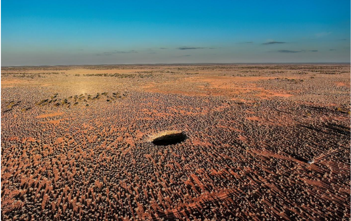
File Name: Nullarbor-2.

The Nullarbor Plain is famous for its giant dolines or 'sinkholes' which are formed by collapse of the limestone into enormous, flooded cave conduits which snake their way through the aquifer which lies ~ 90 meters below the surface. The collapse dolines, which are few and far between, are small windows into segments of the enormous underground river systems which carry ancient groundwater hundreds of kilometers through the limestone aquifer to the Southern Ocean. This doline is 40 meters in diameter, note the vehicle for scale lower right. The integrity and unspoiled intactness of this fragile limestone landscape and world-class cave system is threatened by the proposed Western 'Green' Energy Hub.