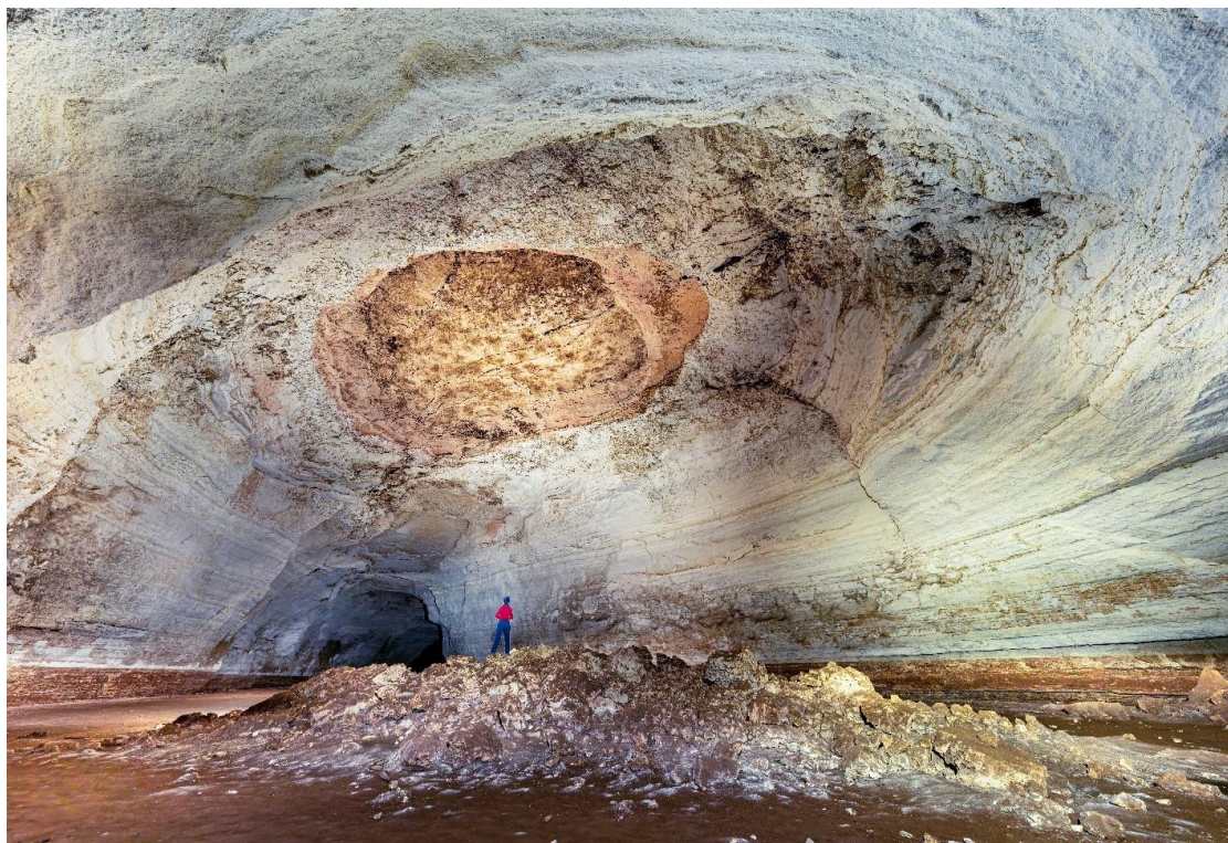
File Name: Nullarbor-1.

This huge cavern is but a short segment of an enormous underground drainage system which carries ancient groundwater hundreds of kilometers from the northern edge of the limestone plain to the Southern Ocean. The proposed energy hub lies only a few kilometers away and within the upstream catchment area of this extraordinary cave system of undoubted World Heritage significance. To the west and east of this cave system there are other similar giant underground river systems carrying groundwater through the Nullarbor limestone aquifer. With a surface area of around 200,000 square kilometers, the Nullarbor Plain indisputably harbors one of the greatest cave and karst systems on Earth.