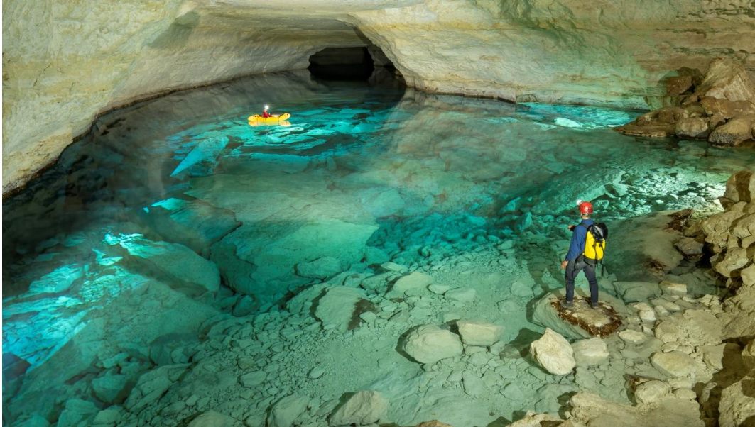
File Name: Nullarbor-3.

This stunningly beautiful cave of undoubted World Heritage quality lies only a few kilometres away from the proposed colossal hydrogen / ammonia production plant and storage facility.