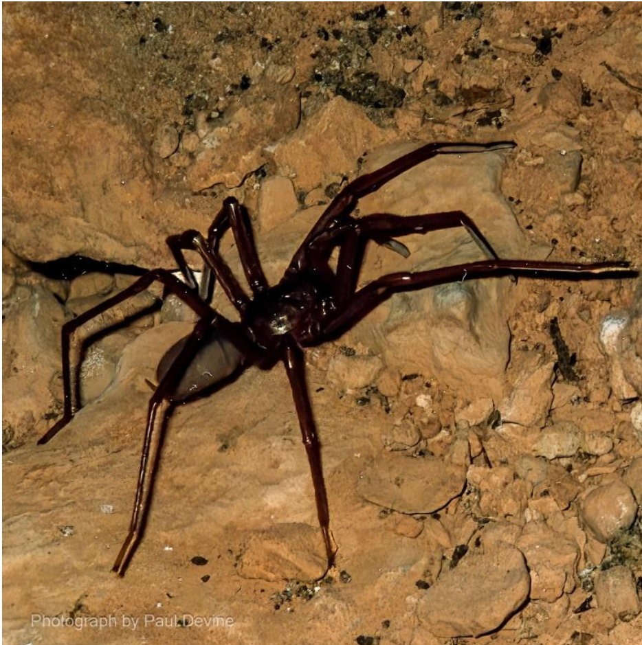
File Name: Nullarbor-6.

The largest, rarest, and most unusual Nullarbor troglobite is a blind spider, Troglodiplura, which is of considerable scientific interest because it is the only known cave-adapted example of its 'family' in Australia and one of only a few such cave-adapted mygalomorphs worldwide. Recent research has found that these spiders are able to migrate tens of kilometers underground in complete darkness between caves using the vast interconnected network of small micro-caves which honeycomb the entire Nullarbor Plain. Troglodiplura is the Australian Cave Animal of the Year 2024.