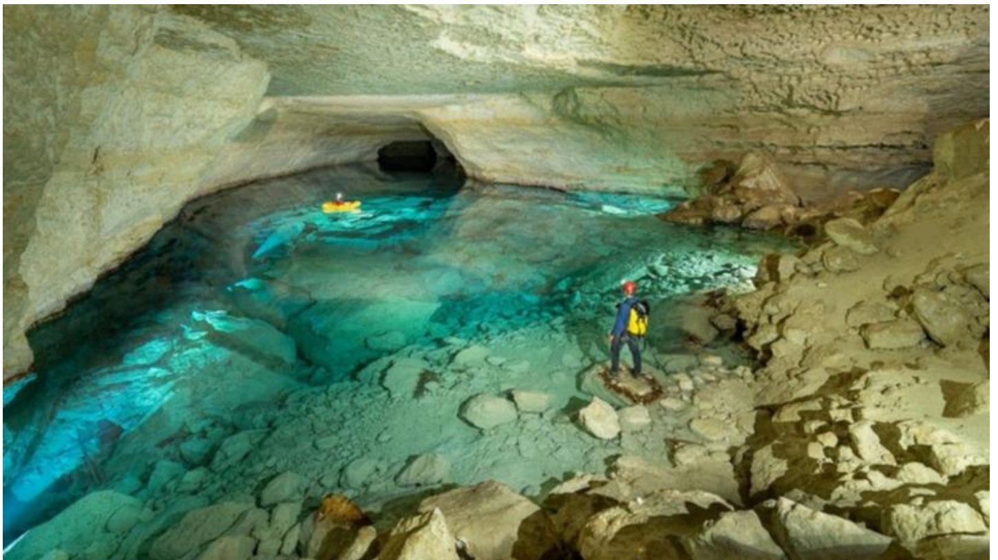
Caves in the Nullarbor Plain.